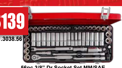
56pc 3/8" Dr Socket Set MM/SAE 3/8" Dr 6pt Sockets (Std) - 5-22mm & 1/4"-7/8", 3/8" Dr 6pt Sockets (Deep) - 10-19mm & 3/8"-3/4", High Quality CrV

This adjustable wrench when used with a 3/8" Drive & 1/2" Drive socket accessory works as an adjustable crowsfoot wrench. Using an extension you can reach into areas that a normal wrench will not go. Ideal for loosening very tight tie rod end lock nuts.