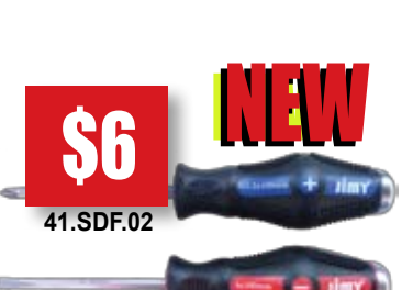
Screwdriver (-) 3 x 75mm (-) 5 x 100mm 41.SDF.03 $12 (-) 6 x 100mm 41.SDF.04 $12.50 (+) 0 x 75mm 41.SDX.02 $6 (+) 1 x 100mm 41.SDX.03 $12 (+) 2 x 100mm 41.SDX.04 $12.50