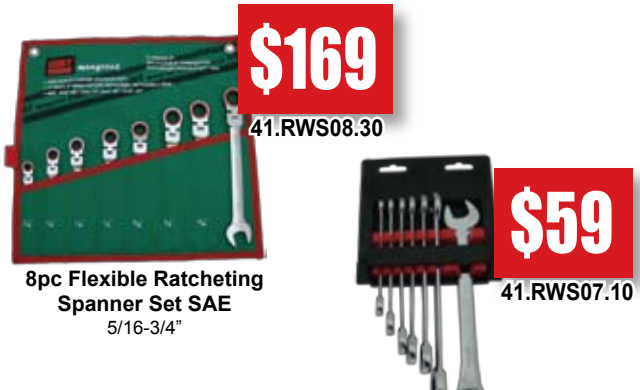
7pc Ratcheting Spanner Set MM 72T, Trade Quality CrV 8, 10, 12, 13, 14, 17, 19mm