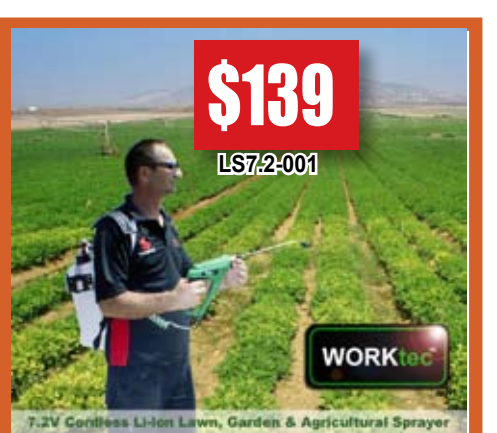
7.2 V Li-ion Garden and Agricultural Sprayer High Quality Sanyo Li-ion Battery Cells

Two Spray Mode - Mist and Stream, Quick Change Spray Lance Extension, LED Function for Dark Areas Charge Indicator, 16L Tank, 50 Minutes of Continuous Run-Time, Comfortable Back Pack Tank Design