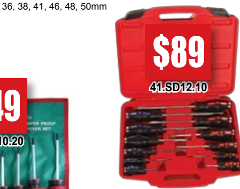
12pc Go Thru Screwdriver Set S2 Magnetic Blade Place allen kev in shaft