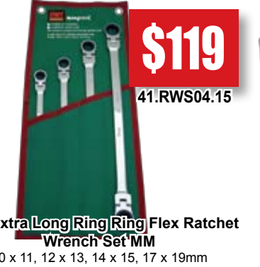
10 x 11, 12 x 13, 14 x 15, 17 x 19mm