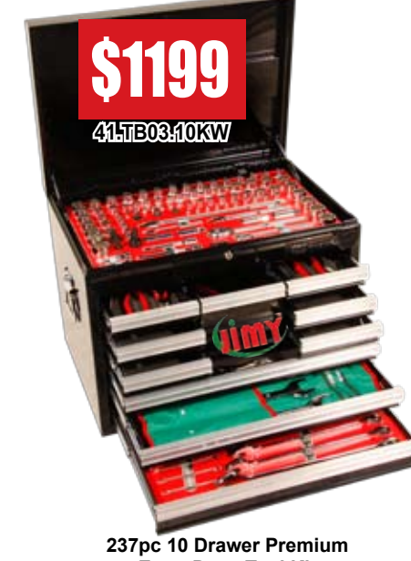
Extra Deep Tool Kit MM & SAE Ring and Open End Spanners

1/4", 3/8" & 1/2" Dr Sockets & Accessories, Spark Plug Sockets, Adaptor, Shifter, Screwdrivers, Pliers, Hammer, Tape Measure, Utility Knife, Hex Keys, Hacksaw, Bit Set Box Size: 660(W) x 455(D) x 483(H)mm