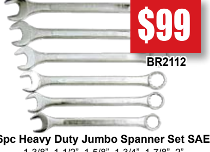
6pc Heavy Duty Jumbo Spanner Set SAE 1-3/8", 1-1/2", 1-5/8", 1-3/4", 1-7/8", 2" MM BR2112M $99