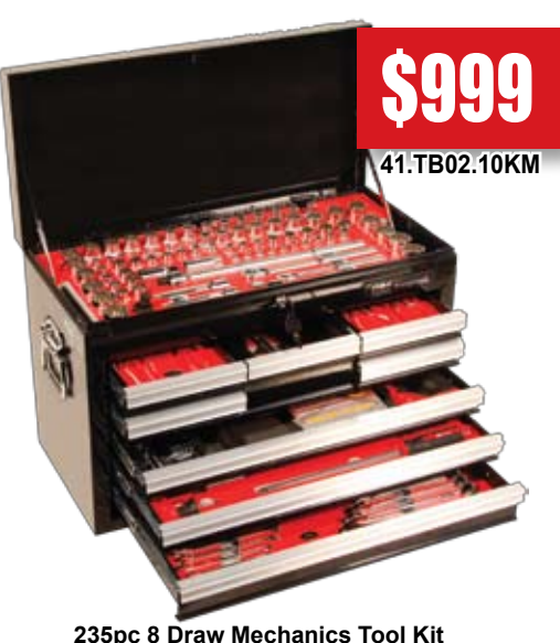
MM & SAE Ring and Open End Spanners. 1/4", 3/8" & 1/2" Dr Sockets & Accessories. eark Plug Sockets. Adaptor. MM & SAE Crowsfoot & Flare Nut Spanners. Torx Spanners and Sockets. Shifter, Screwdrivers, Pliers, Multi-grip, Tape Measure SAE and MM Hex Keys. Bit Set. Box Size: 660(W) x 307(D) x 427(H)mm