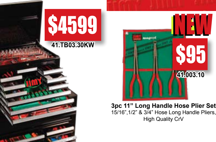
15/16",1/2" & 3/4" Hose Long Handle Pliers

739pc 23 Drawer 'BIG DADDY' Extra Wide Tool Kit Ring and Open End (Std & Geared), Ring Ring Standard & Long, Flare Nut, Crowsfeet. 1/4", 3/8", 1/2" & 3/4" Dr Sockets (CrV & CrMo) and Accessories. Spark Plug Sockets. Adaptor. Shifter. Screwdrivers (Standad & TORX). Pliers. Hammers. Pry Bars. Tape Measure. Utility Knife. Tin Snips. Scraper. Hex Keys. Hacksaw. Bit Sets. Hook & Pick. Punches & Chisels. Brush Set. Deburring. Snips Pipe Wrench & Bolt Cutter. Clamps. Circuit Tester & Terminal Set. Pick Up & Inspection Tools, Magnetic Tray, Torque Angle Meter, Filter Wrench, Hose Clamps Vernier, Flashlight, Air Impact Gun & Air Die Grinder Kit. Top Box Size: 660(W) x 455(D) x 483(H)mm Roller Cab Size: 1070W) x 460(D) x 980(H)mm