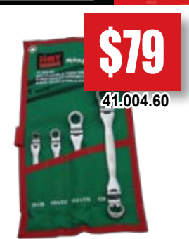
4pc Flex Torx Spanner Set E6xE8, E10xE12, E14xE18, E20xE25