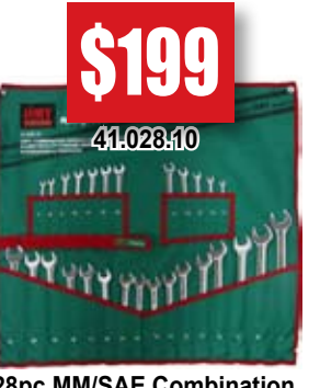
28pc MM/SAE Combination ROE Spanner Set 1/4"-1" & 7-21mm Cr\