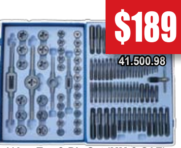
110pc Tap & Die Set (MM & SAE) h Quality Alloy steel, HSS