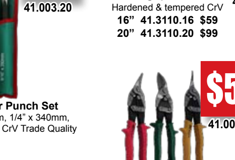
3pc Tin Snip Set (in pouch) Left, Straight, Right CrV Trade Quality