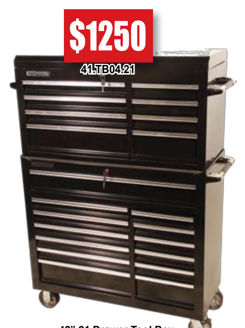
42" 21 Drawer Tool Box Top Box Size: 1050(W) x 445(D) x 552(H)mm Roller Cab Size: 1066(W) x 458(D) x 1008(H)mm